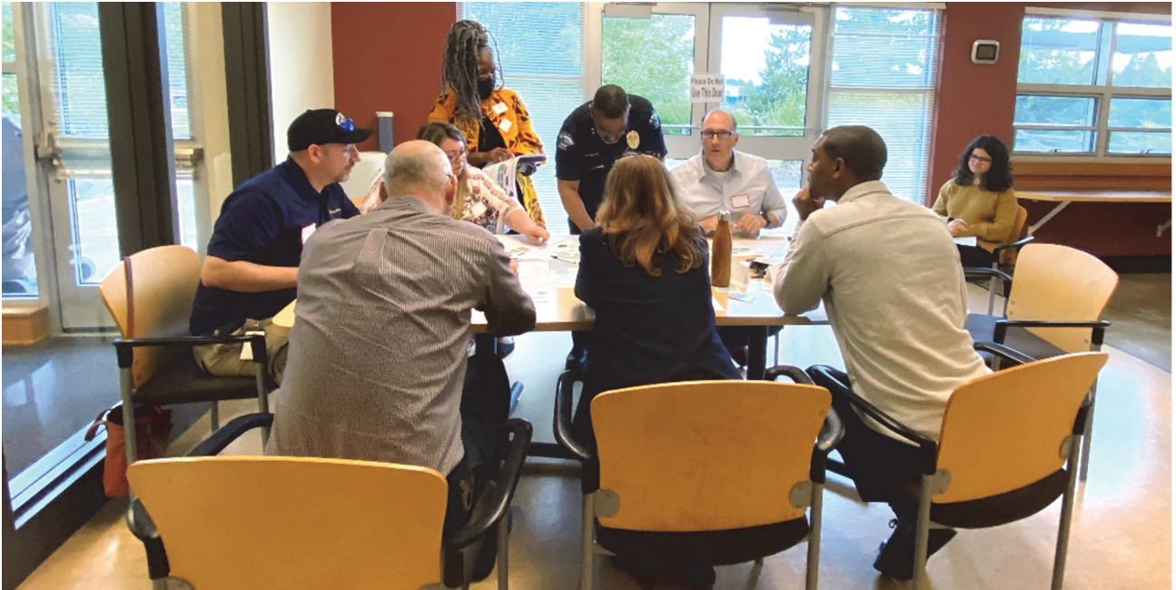
Senior and elected officials divided into small groups to perform a transportation recovery exercise on June 6, 2022.