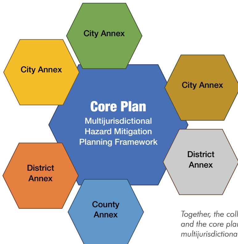
Figure 6.1 Thurston Region Hazards Mitigation Plan Components

Together, the collection of the jurisdictional annexes and the core plan form the Thurston Region’s multijurisdictional hazard mitigation plan.