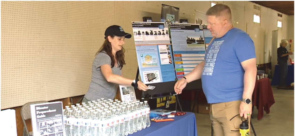
Visitors learned about natural hazards and preparedness at the 2023 Thurston County Fair.

The Hazard Mitigation Plan participants value the input of community members in shaping the Hazards Mitigation Plan for the Thurston Region. To ensure transparency and inclusivity, the final draft of the plan underwent a public