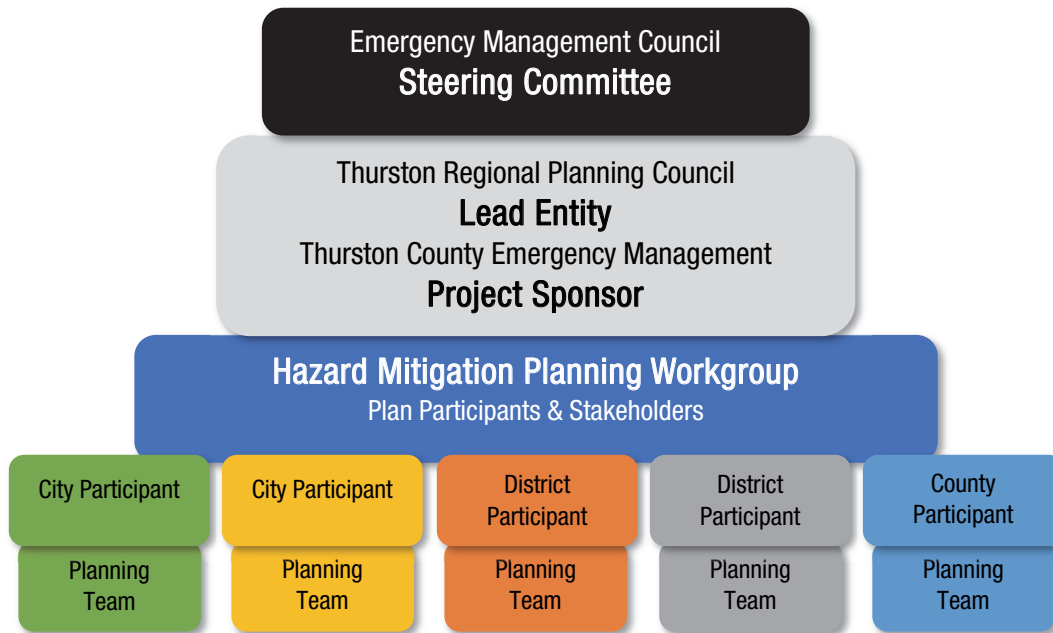
Figure 6.3 Multijurisdictional Hazard Mitigation Planning Entities Relationship