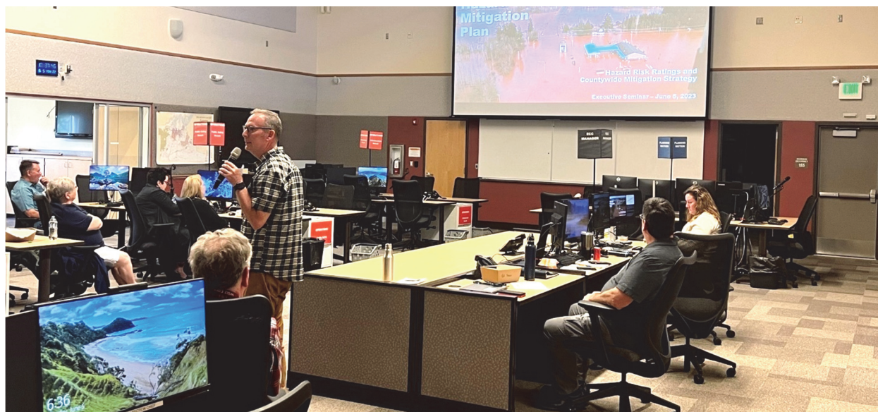
Community leaders received a mitigation planning risk assessment briefing on June 5, 2023.

Education and outreach activities deliver important hazard mitigation and disaster resilience information to organizations and community members. Providing information to promote hazard awareness and increase risk reduction is a priority of the region’s mitigation strategy.