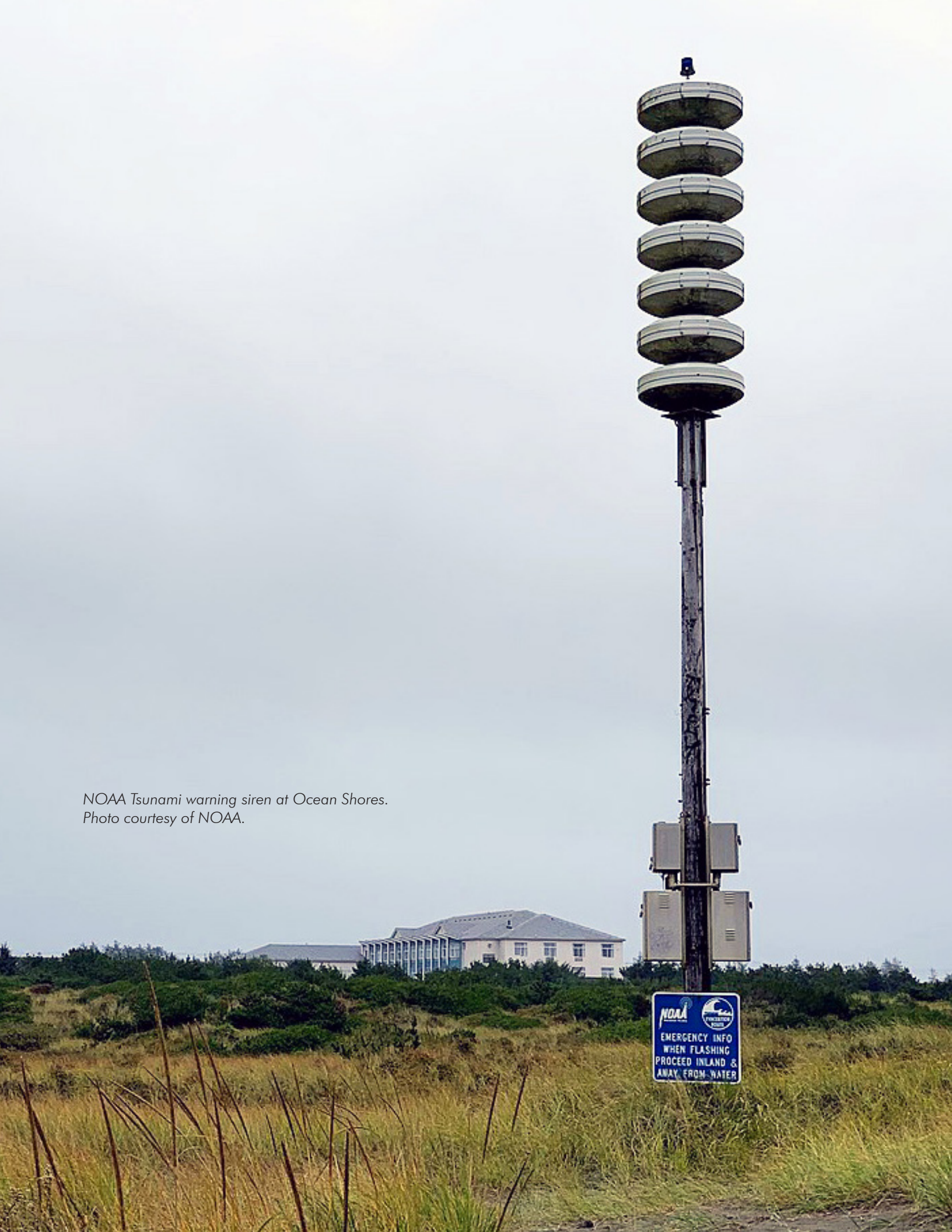
NOAA Tsunami warning siren at Ocean Shores.