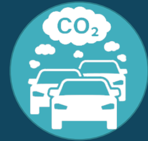
GHG Emissions Reduction