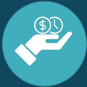
Efficient Use of Federal Funds