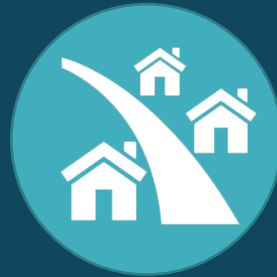
Sustainable Thurston Urban Corridors and Centers