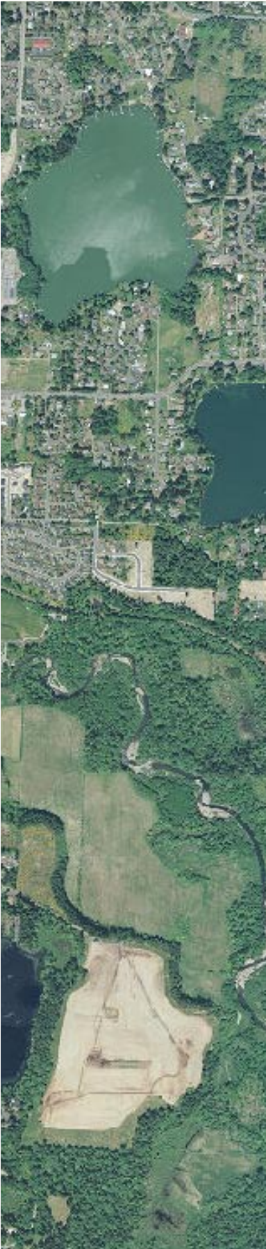
Ward Lake, Hewitt Lake, Deschutes River, Olympia/ Tumwater.