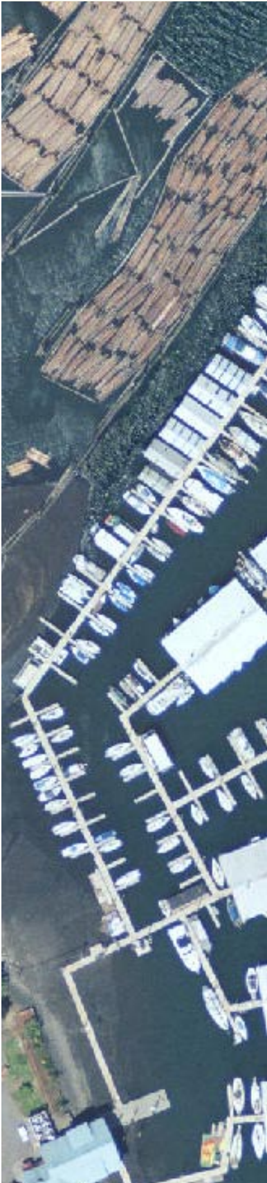
West Bay Marina, Olympia